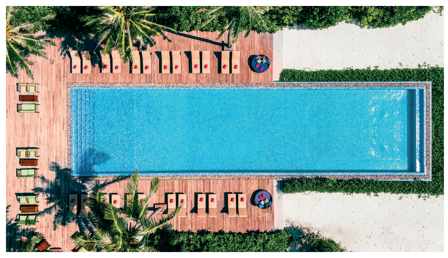
GUESTS AT SIYAM WORLD HAVE MORE THAN A DOZEN DIFFERENT BARS AND RESTAURANTS TO CHOOSE FROM.