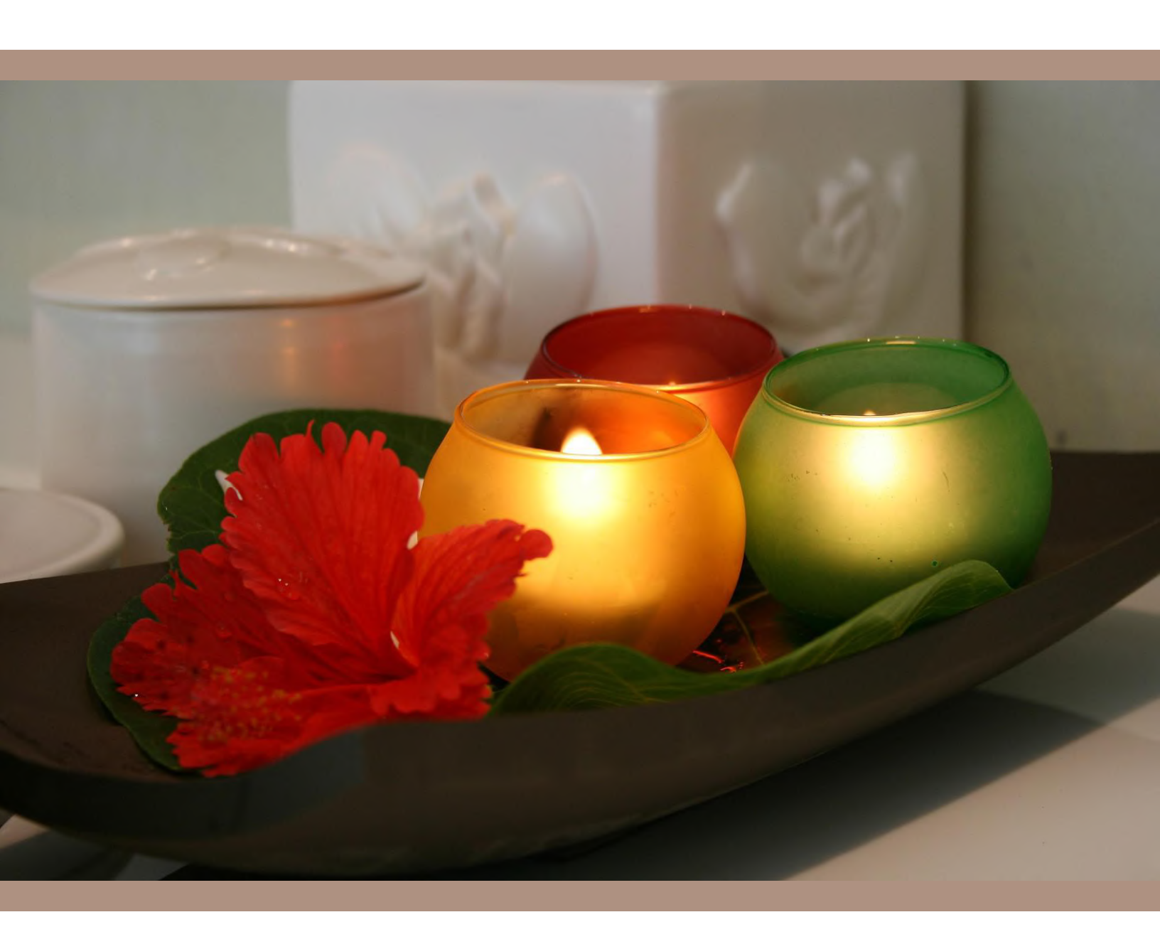
pure essence of ultimate wellbeing