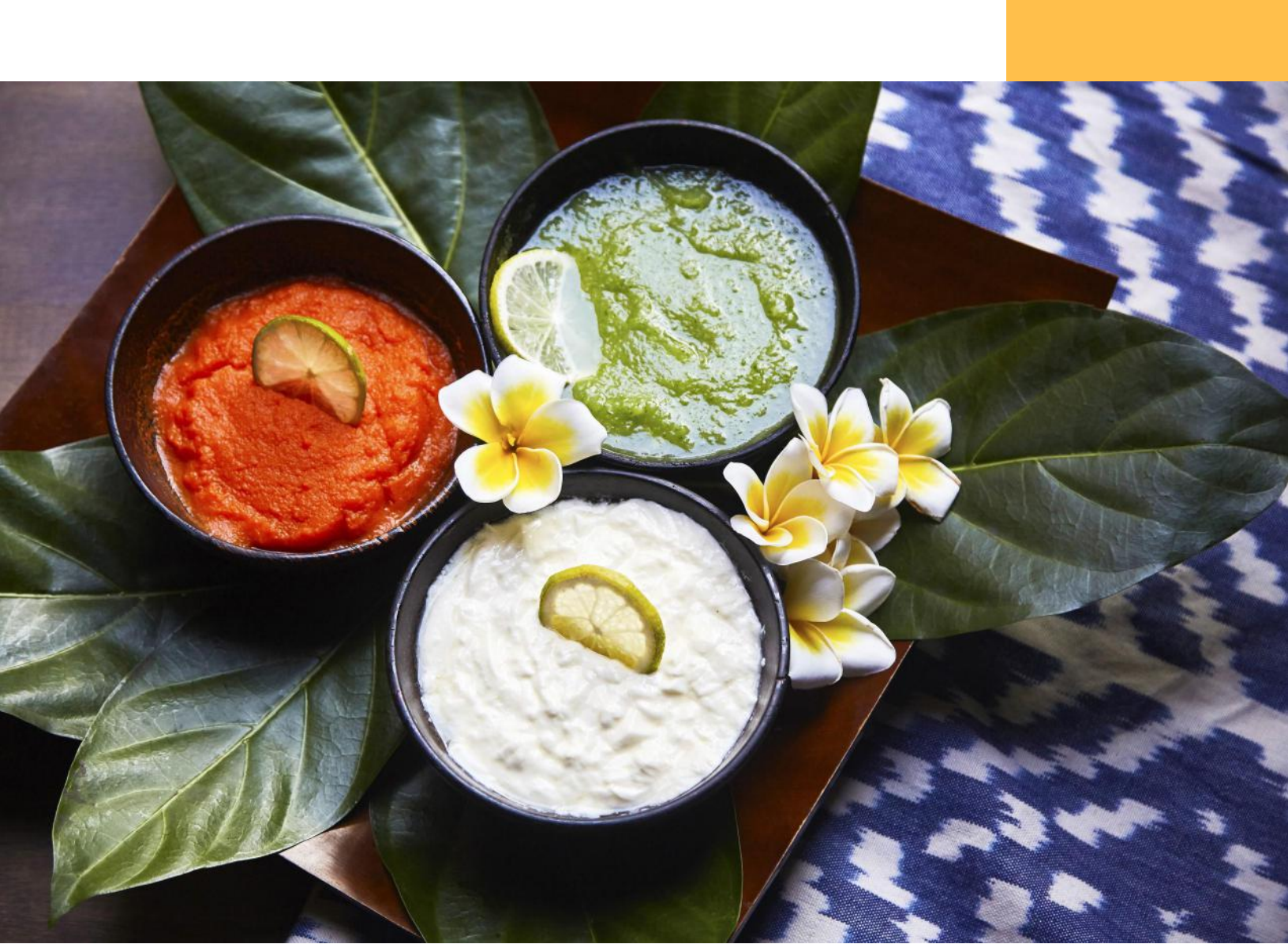
a la carte body treatment