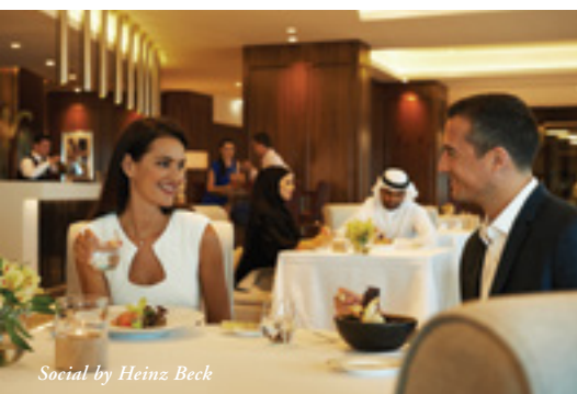
Social by Heinz Beck

THE PALM JUMEIRAH, EAST CRESCENT, P.O. BOX 24988 DUBAI, UNITED ARAB EMIRATES +971.4.818.2222 | dubai@waldorfastoria.com | waldorfastoria.com/dubai