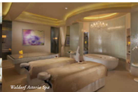
Waldorf Astoria Spa