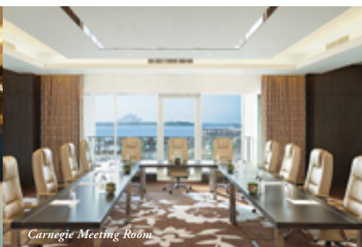
Carnegie Meeting Room