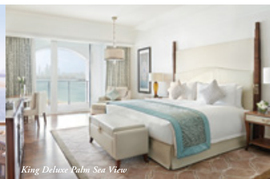
King Deluxe Palm Sea View