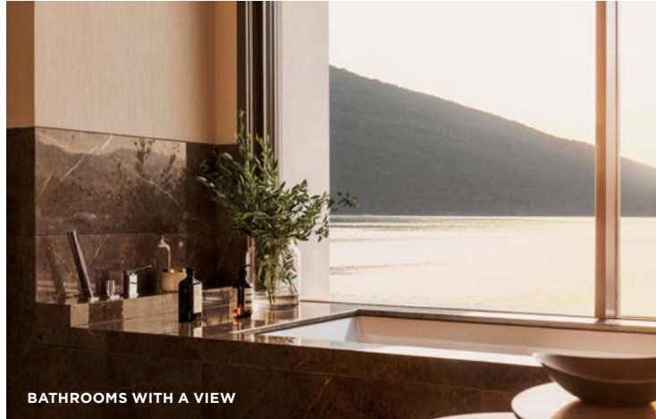
BATHROOMS WITH A VIEW