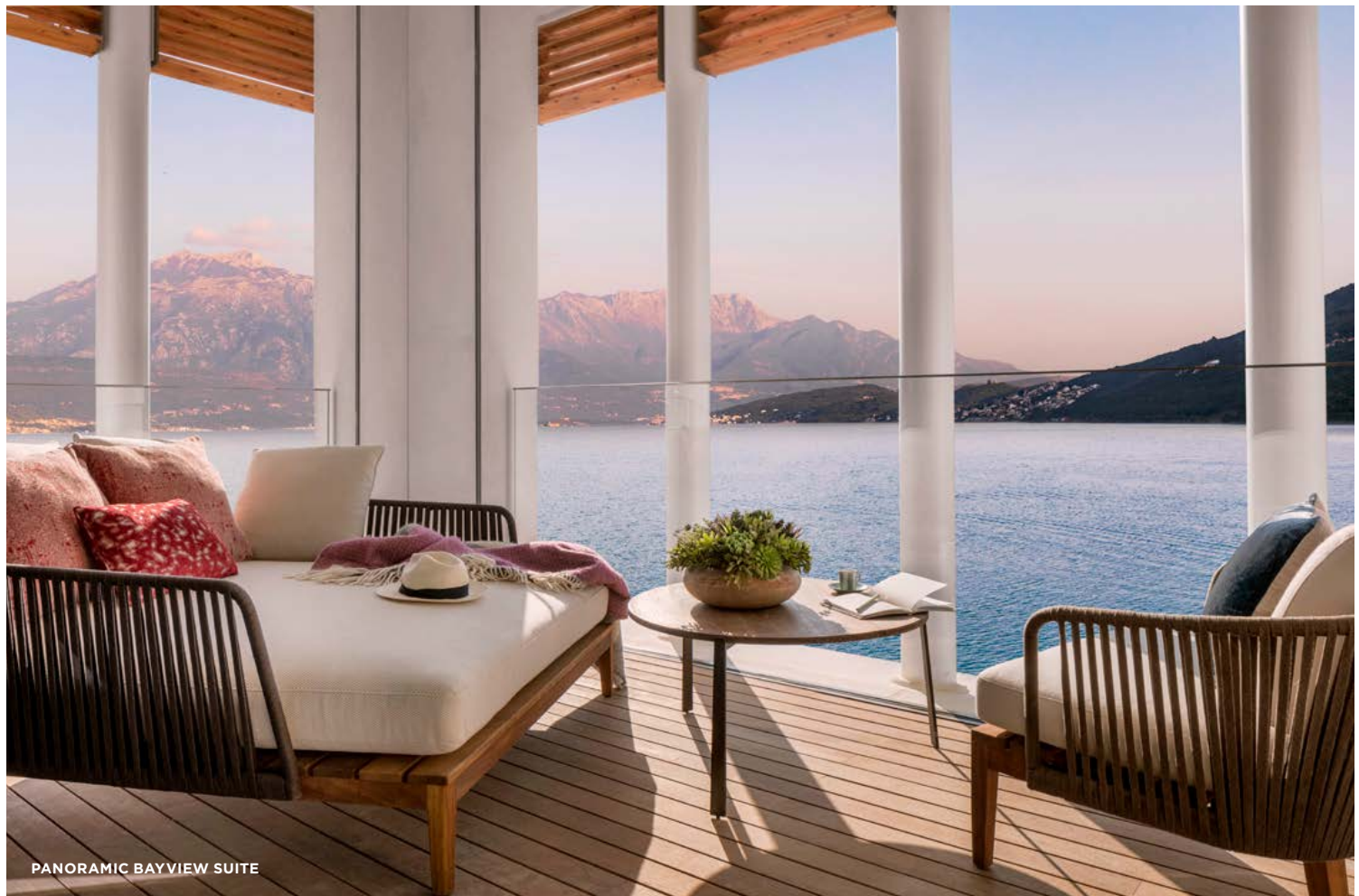
PANORAMIC BAYVIEW SUITE