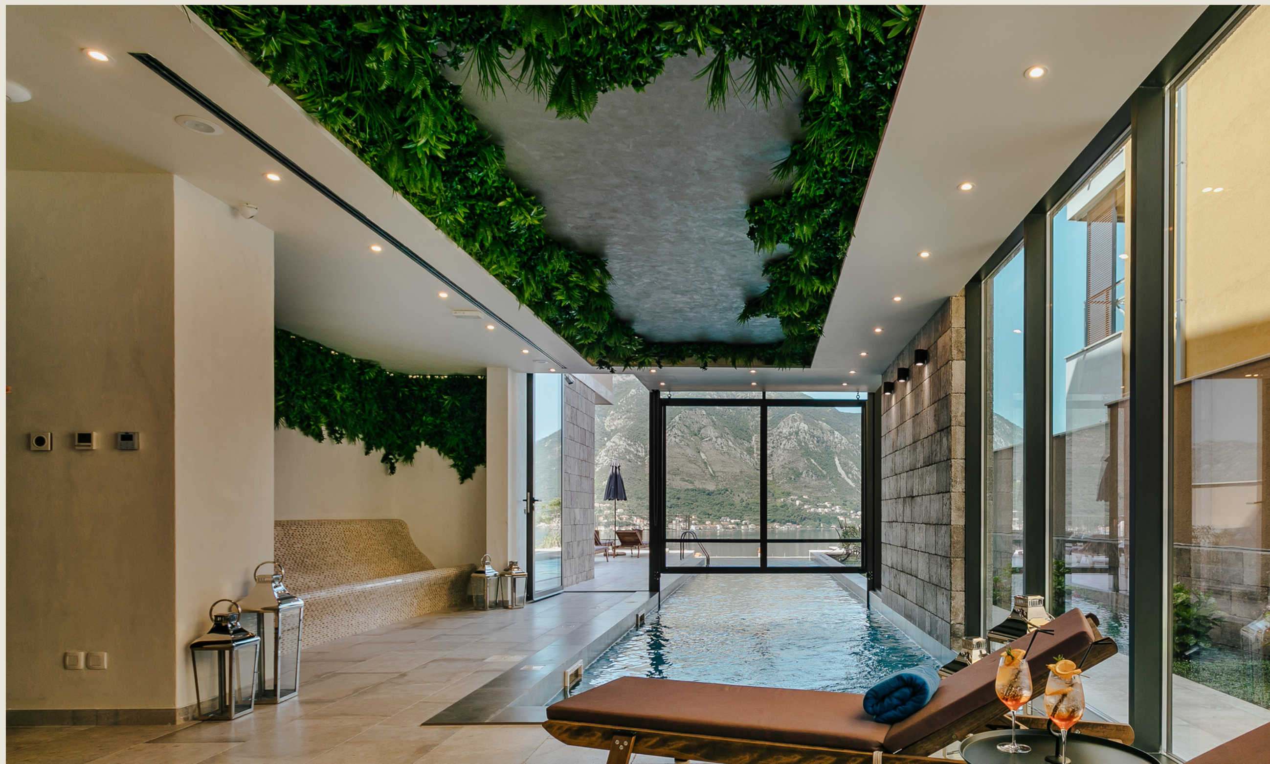
SPA & WELLNESS ZONE