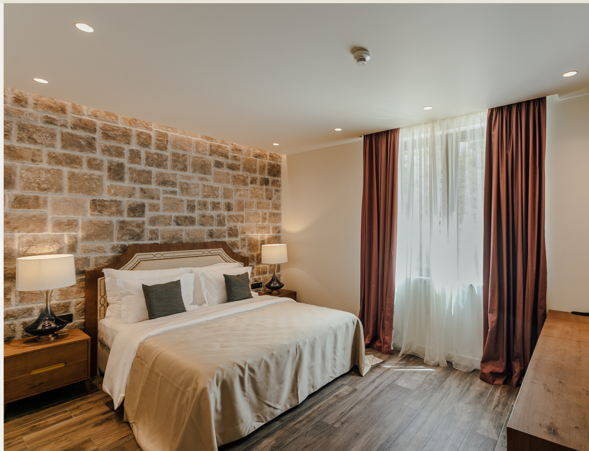
ONE BEDROOM APARTMENT sea view 2 apartments

* the extra bed could be provided by request (see extra beds rates)