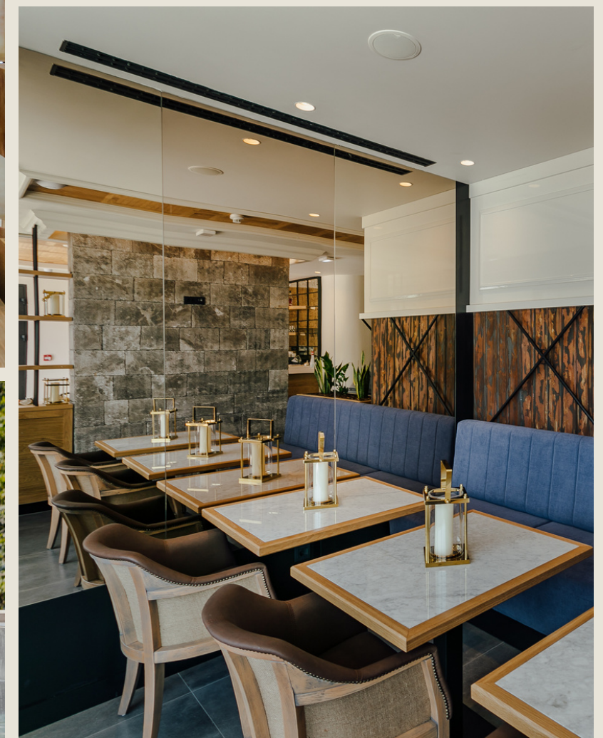
HOTEL FACILITIES Casa del Mare Vizura