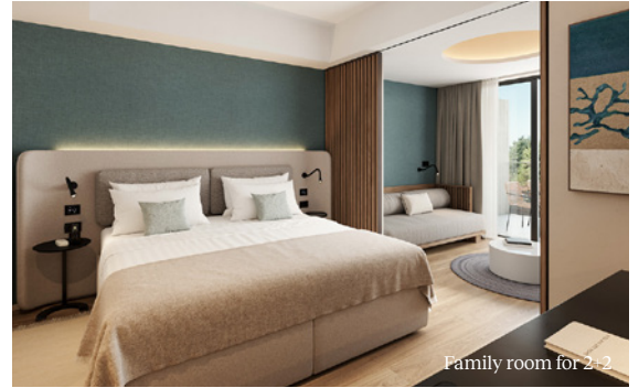
Family room for 2+2