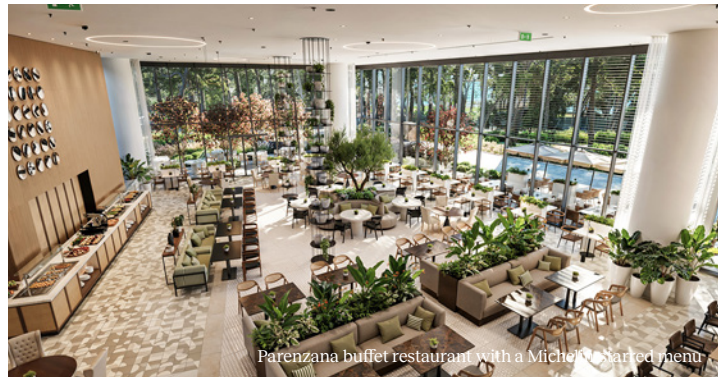
Parenzana buffet restaurant with a Michelin Starred menu