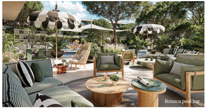
Bonaca pool bar