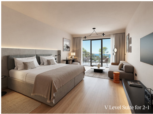
V Level Suite for 2+1