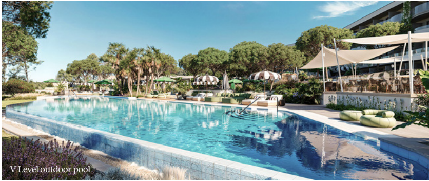
V Level outdoor pool