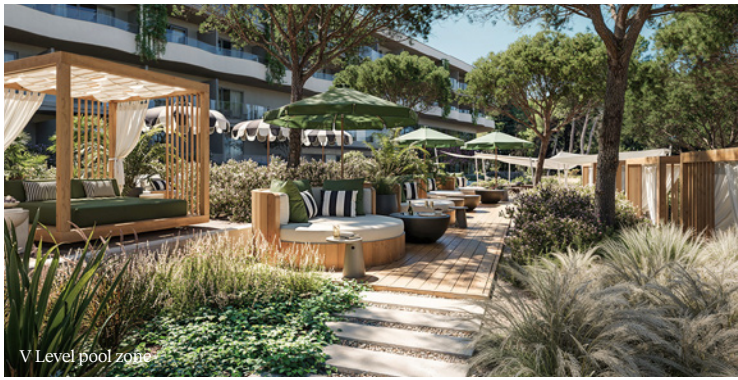
V Level pool zone