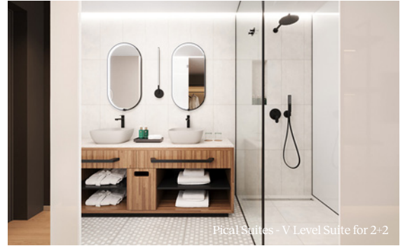
Pical Suites - V Level Suite for 2+2