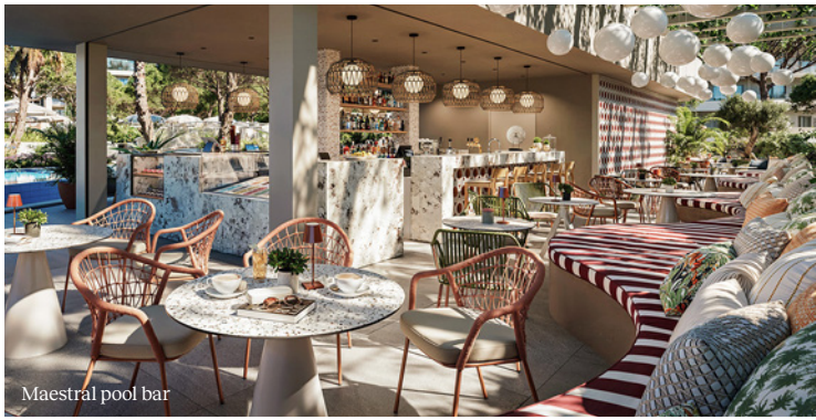
Maestral pool bar