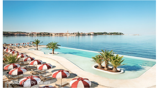
Infinity pool by the sea