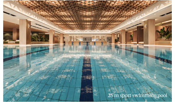
25 m sport swimming pool