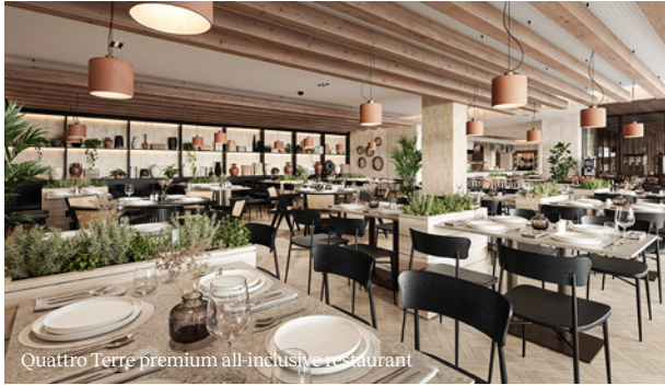
Quattro Terre premium all-inclusive restaurant