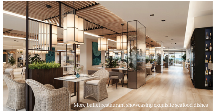
More buffet restaurant showcasing exquisite seafood dishes