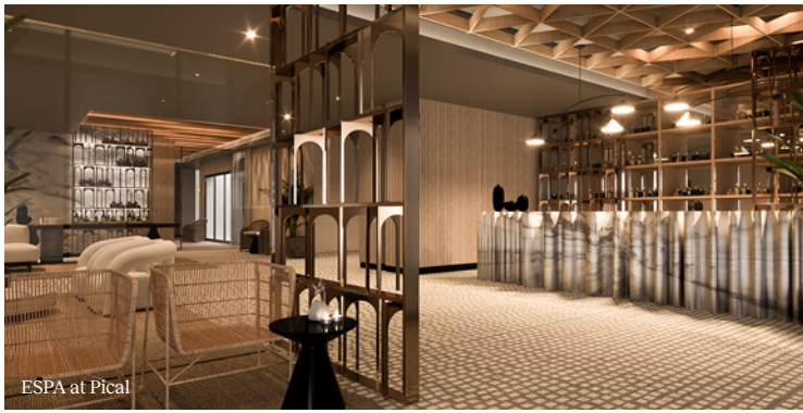
ESPA at Pical