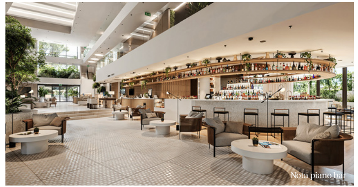
Nota piano bar