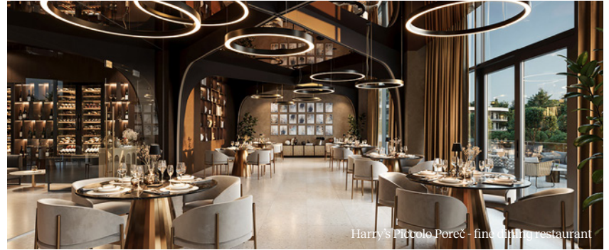
Harry's Piccolo Poreč - fine dining restaurant